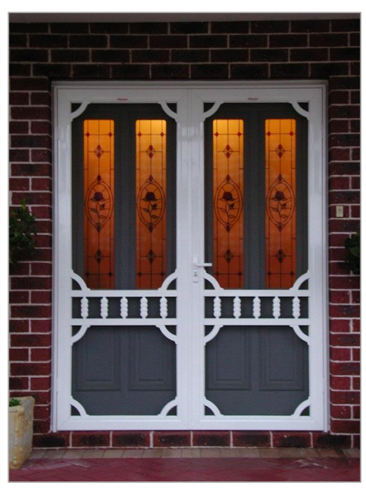
CG12 Decorative Doors

Our PROMESH Decorative security doors make you feel like you have the security of a fortress without compromising the warmth and comfort of your home.